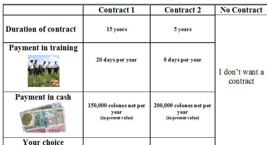
Figure 3. The relationship between level of payment and participation in a PES contract.