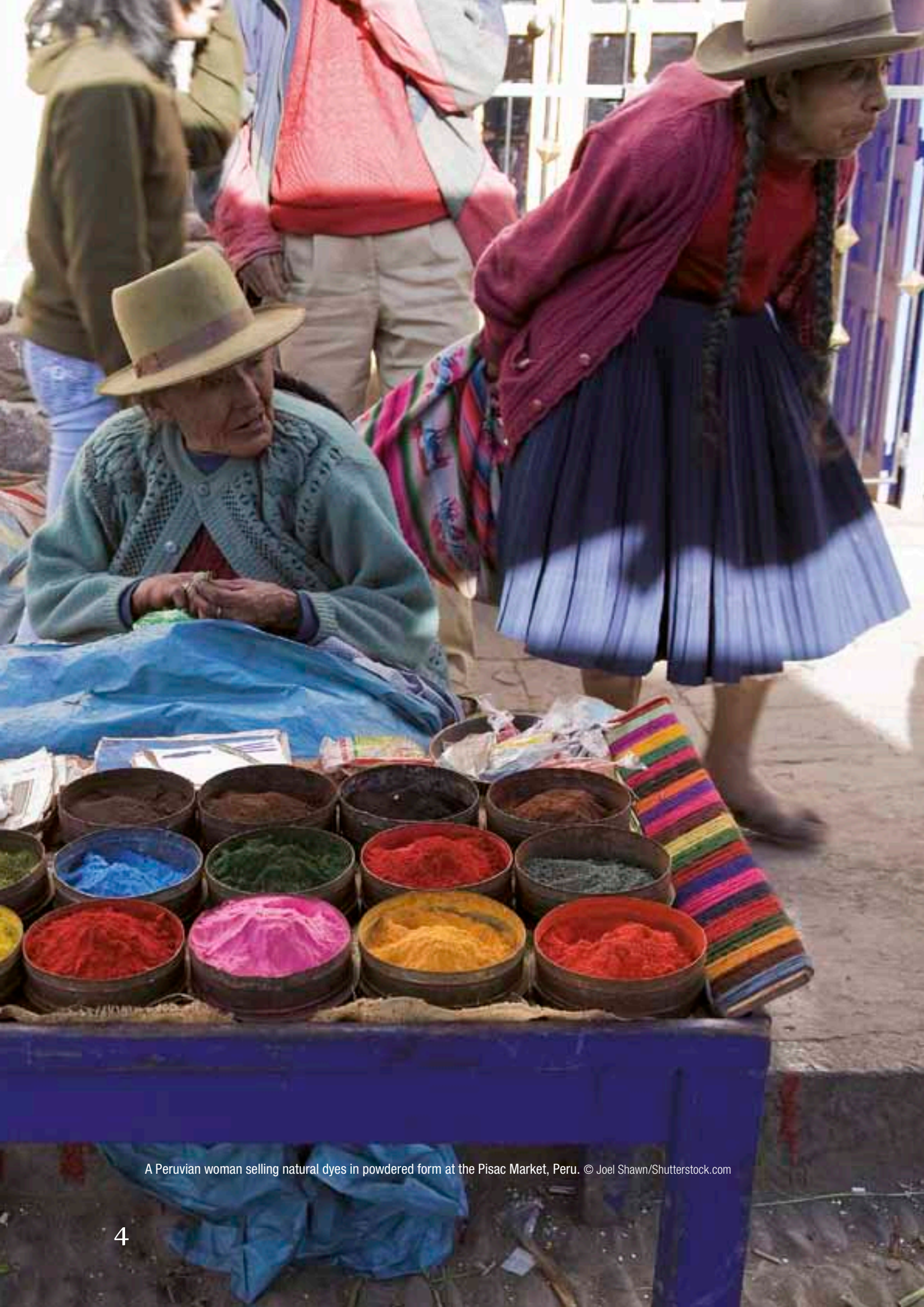
A Peruvian woman selling natural dyes in powdered form at the Pisac Market, Peru.