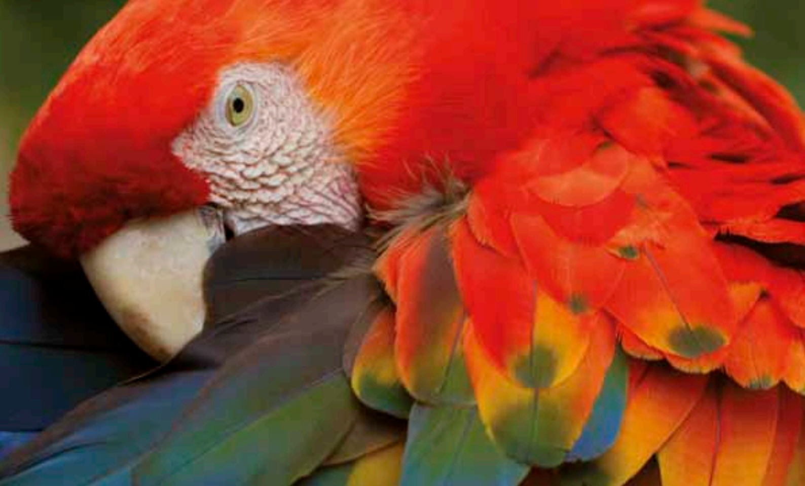
The large and vibrant Scarlet Macaw is native to the Peruvian Amazon and other humid forests in the American tropics.

habitats and biodiversity have been key factors supporting various branches of the economy, particularly industries such as agriculture, pharmaceuticals, tourism, fishing and manufacturing. Ecosystems provide raw materials for many industries, including food and beverage production and cosmetics (Box 1). A recent success story in that regard is Peruvian gastronomy. Based heavily on local products and ingredients, Peruvian cuisine has reached world-wide fame. In the last three years, the number of Peruvian restaurants in the United States has doubled to 400. The company Sodexo now serves 23 Peruvian dishes to 27 million diners in seven countries around the world. 15