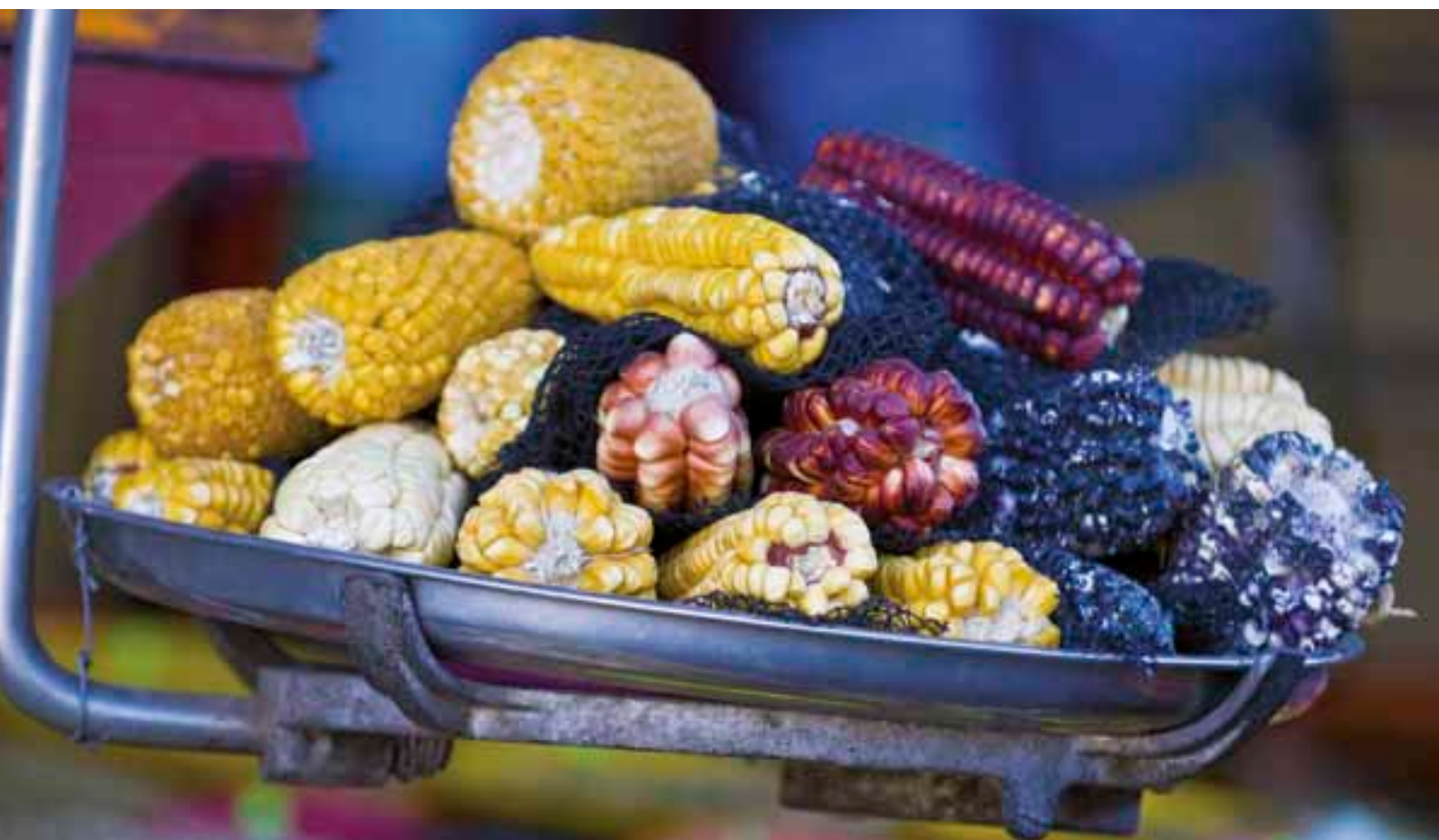
A variety of corn, including the quintessential purple corn, on sale at a market in Peru.

Peru has the potential to become a leader and a model for other countries to follow, in their transition to a green economy, due to its abundant natural resources, which have the capacity to create a unique array of products, whilst offering economic benefits to the poor and protecting the environmental assets on which they depend for their livelihoods.