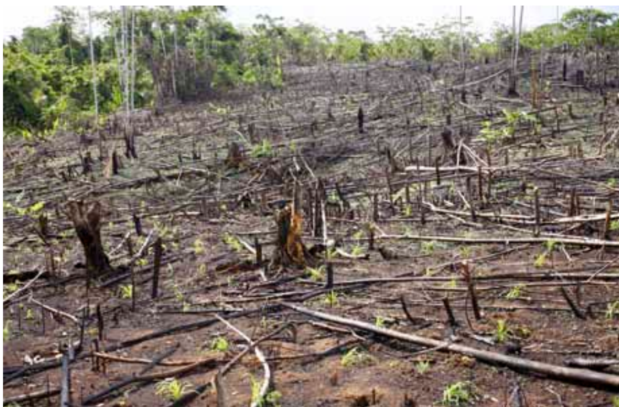
Slash and burn cultivation in the Peruvian Amazon - a clearing in the rainforest planted with corn seedlings.