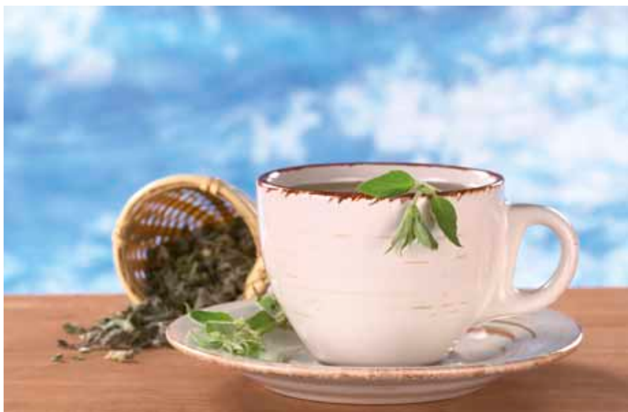
Herbal tea with the Peruvian herb muna, a digestive aid with mint-like flavour.

regular production, is a positive driving force for the livelihood of many people (IFOAM, 2010). As a consequence of price premiums paid and low costs of production, these products obtain a greater value in the production chain. The demand is already in place and growing for organic products. ►