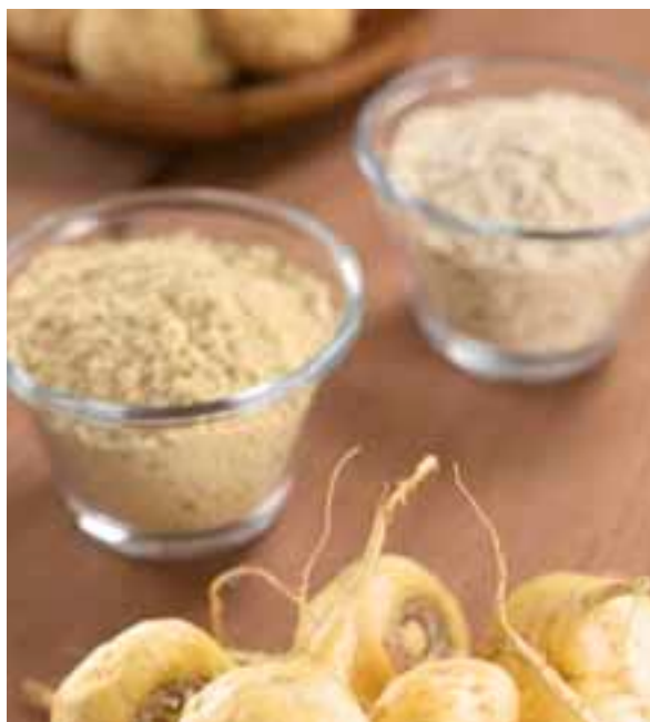
Fresh maca roots, or Peruvian ginseng, with maca powder and maca cookies.

The domestic BioTrade product market is also growing rapidly. Unfortunately, as no data is available on domestic