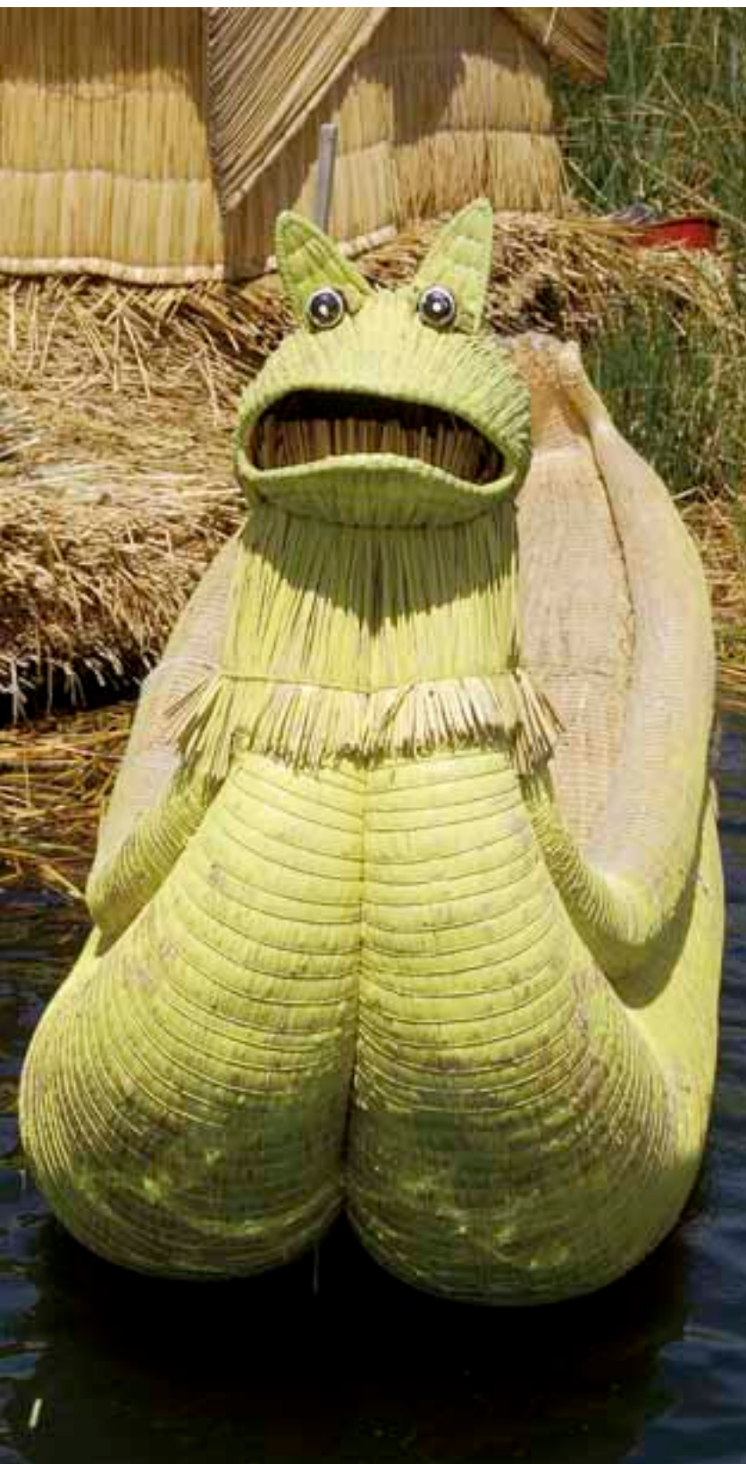
Lake Titicaca, Peru, has a dense water reed that is used to build boats, homes and even floating islands.

globally but have not been promoted or advertised to the same degree as the aforementioned products. Increased investment in policies promoting BioTrade will help raise global awareness of the Peruvian natural heritage and the specific attributes of its BioTrade products. Market demands must be fully understood and market research must be carried out for the local industry. In addition, as domestic spending is growing, assistance should also be provided to producers and companies selling within Peru. Sales to the domestic market can help companies improve their cash flow and these revenues can, in turn, be used for global expansion.