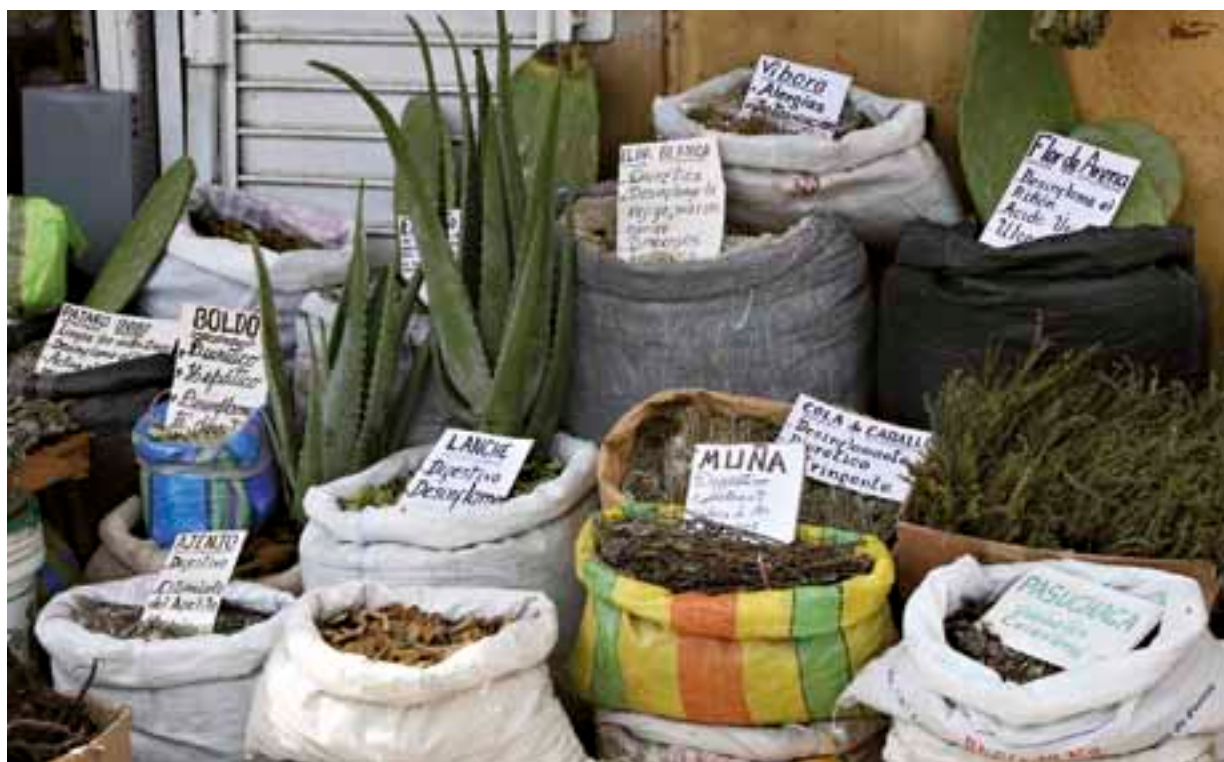
A street market in Peru featuring products traditionally used for medicinal purposes.

Finally, foreign market power is a key problem pushing producers to lower prices. International buyers of raw materials have price-setting power across the industry value chain. Most exporters earn very low profits from their operations, impacting all stakeholders. ►