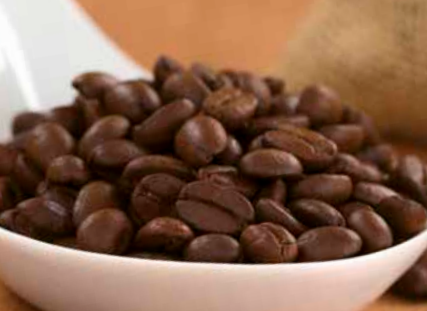
Roasted Peruvian coffee is a leading organic export of the country.

consumption, it is difficult to estimate the size of the market. What can be observed, however, is that consumption of natural products is on the rise, and that some of them are now available in local supermarkets. Leading stores such as Wong, Vivanda and Plaza Vea are beginning to display and sell new lines of bioproducts. The donor community and local businesses have launched interesting initiatives, such as weekly eco-markets ( bio-ferias ), where some of the BioTrade companies certified by the UEBT sell their products. The total annual turnover of the bio-ferias is estimated at USD 3 million. 28 Five local natural-product store chains also have a strong product proposition tailored at the domestic market. The leaders, such as Santa Natura and Bionaturista, have a combined strength of 54 stores nationwide.