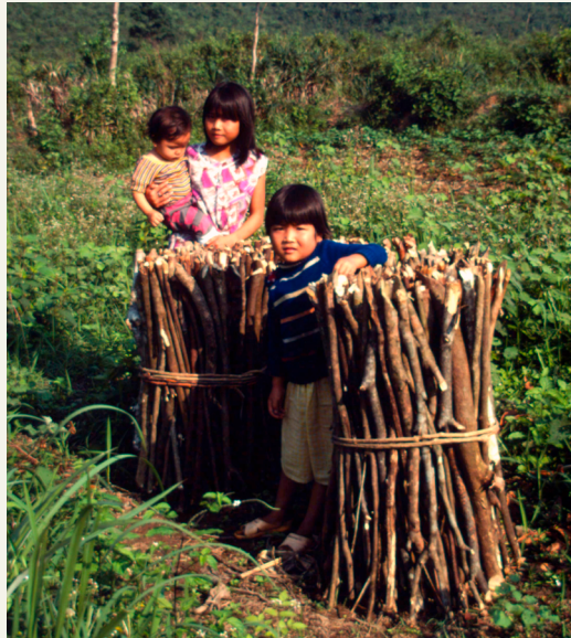
Village children with fuel wood at the fringe of Bach Ma National Park, Vietnam.

CarBi will support Afforestation, Regeneration, CFM and Protection contracts until the end of the project (which is December 2016); after this deadline they will be transitioned to be included in the Forest Protection and Development Fund PFES schemes (described below) in the target areas to continue payments and forest management beyond this date. This PFES schemes are creating employment, enhancing livelihood resilience and restoring forests in priority biodiversity corridor areas; all while establishing experience and a structure for PFES in these communities.