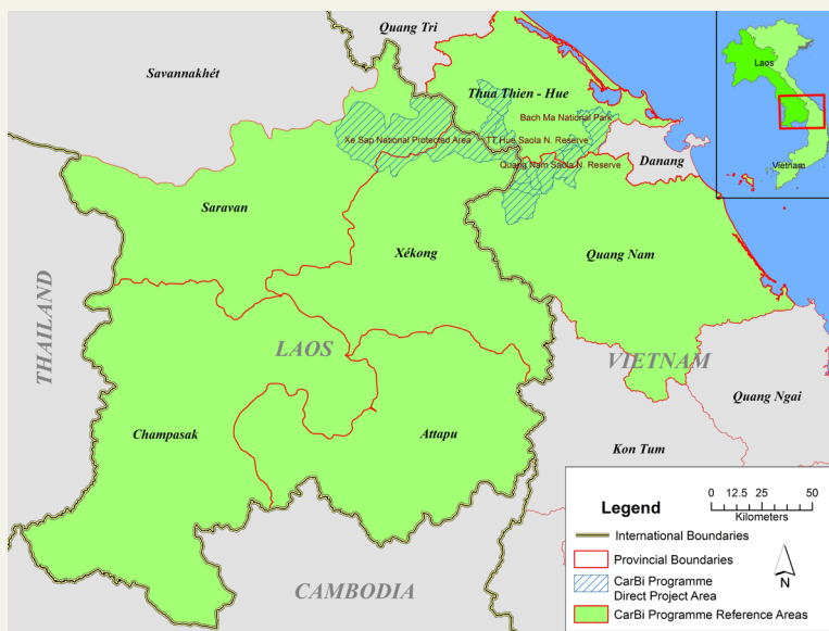
FIGURE 1: CARBI PROJECT LOCATION

CarBi operates in six provinces, Quang Nam and Thua Thien-Hue in Vietnam, and Saravan, Xekong, Champassak and Attapue in Laos. Its four main components are Protected Area Management, Forest Restoration, Timber Trade and REDD+/PFES. Its protected area management interventions are focused on 4 national protected areas, complemented by specific forest restoration operations in two biodiversity corridors.