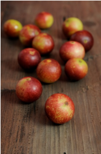
Camu camu fruit, source: MANCHAMANTELES/PromPerú.