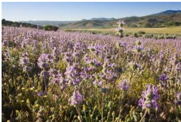
Chia, source: http://deborahsmall.wordpress.com/2008/07/23/gathering-thistle-chia/ .