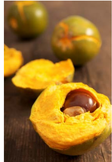
Lucuma, source: MANCHAMANTELES/PromPerú.