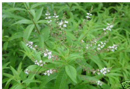
Lemon verbena

( Aloysia triphylla (L'Herit) Britton), native to South American countries (Uruguay, Paraguay, Argentina, Chile and Brazil), is a deciduous perennial shrub that can reach up to 5 meters. It is widely cultivated in South America but has also been introduced to Africa where it is now also farmed in South Africa, Morocco and Algeria. It is a member of the Verbenaceae family and grows naturally as well as being cultivated. The leaves and flowering tops are used to make an infusion that is consumed as an herbal tea with aromatic, digestive, and antispasmodic properties, and it has been used traditionally to treat colds, fever and spasms. 51 Antioxidant activity has been recorded in the leaves and has been