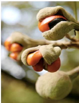
Trichilia emetic seed, source: PhytoTrade Africa.

Mafura ( Trichilia emetica Vahl) belongs to the Meliaceae family and is an evergreen, slow growing hardwood tree that can reach a height of 30m. Mafura is distributed throughout southern Africa at low altitudes and in areas not affected by frost. The species is also found along rivers and the coast where rich alluvial soils are dominant. 81 The seeds are soft and rich in oil, bright red, and held in bunches in the fruit capsules.