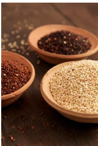
Quinoa , source: MANCHAMANTELES/ PromPerú.