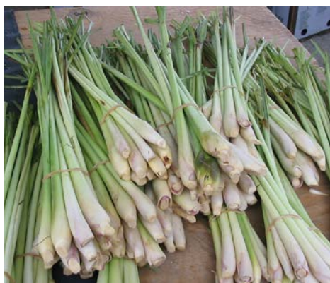
Lemon grass, source:

In addition, Hibiscus sabdariffa is regarded as the predominant commercially available anthocyanins food colorant source, making it popular as a natural food colouring agent. After harvesting, once the flower has dropped, the red calyces are dried, usually in May. Across the world, different harvesting methods are used: either the entire plant is cut or only ripe calyces are removed. Generally harvesting takes place every 10 days until the end of the growing season which is from December through to January. On average, the drying ratio is 10:1. The United States and Germany are said to be major importers of hibiscus, where the dried calyx is used as the base for many herbal teas. 46 Hibiscus is listed as one of the top 10 fastest growing ingredients in hot drinks in 2008-2009, seeing a 1.97% increase in use during 2009. 47