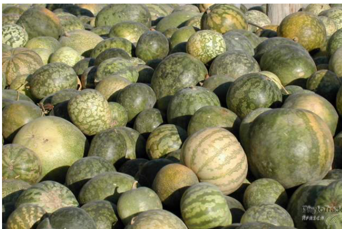
Kalahari melon, source: PhytoTrade Africa.

Kalahari melon ( Citrullus lanatus THUNB.) is native to the western Kalahari region of Namibia and Botswana. They are adapted to drought conditions and are also found in parts of Zimbabwe and Zambia. Kalahari melon is a creeping annual herb that belongs to the Cucurbitaceae family. 74 The flesh of the Kalahari melon is pale yellow or green, unlike the common watermelon, and is bitter in taste. Kalahari melons are currently wild harvested and the seeds are collected from the fruit flesh. As well as being edible, protein rich and used in cooking, the seeds are pressed for oil and used in cosmetic preparations. They are rich in clear, yellow oil which has a history of use as a cosmetic ingredient and is used to moisturise and provide regenerating and restructuring properties. The oil consists of glycosides of linoleic, oleic, palmitic and stearic acid which provides the properties that make it excellent for soap-making, moisturising and conditioning. 75