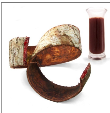
Croton lechleri , source: Fragma Fotografia /PromPerú.