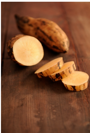
Yacon , source: MANCHAMANTELES/PromPerú.