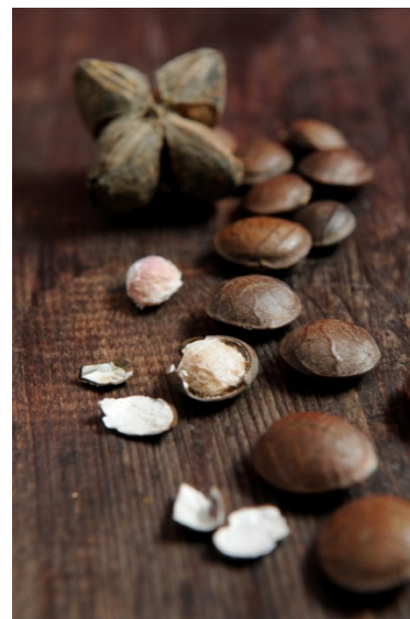
Sacha inchi